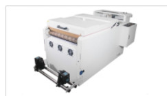
High Power Drying