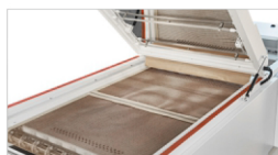
Mesh Belt Drying